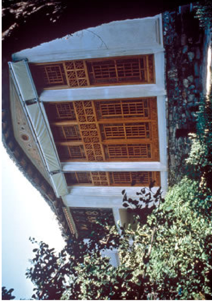
The Mansion where Bahá'u'lláh spent the years of His childhood and youth. Demolished by the Iranian Government in 1981.