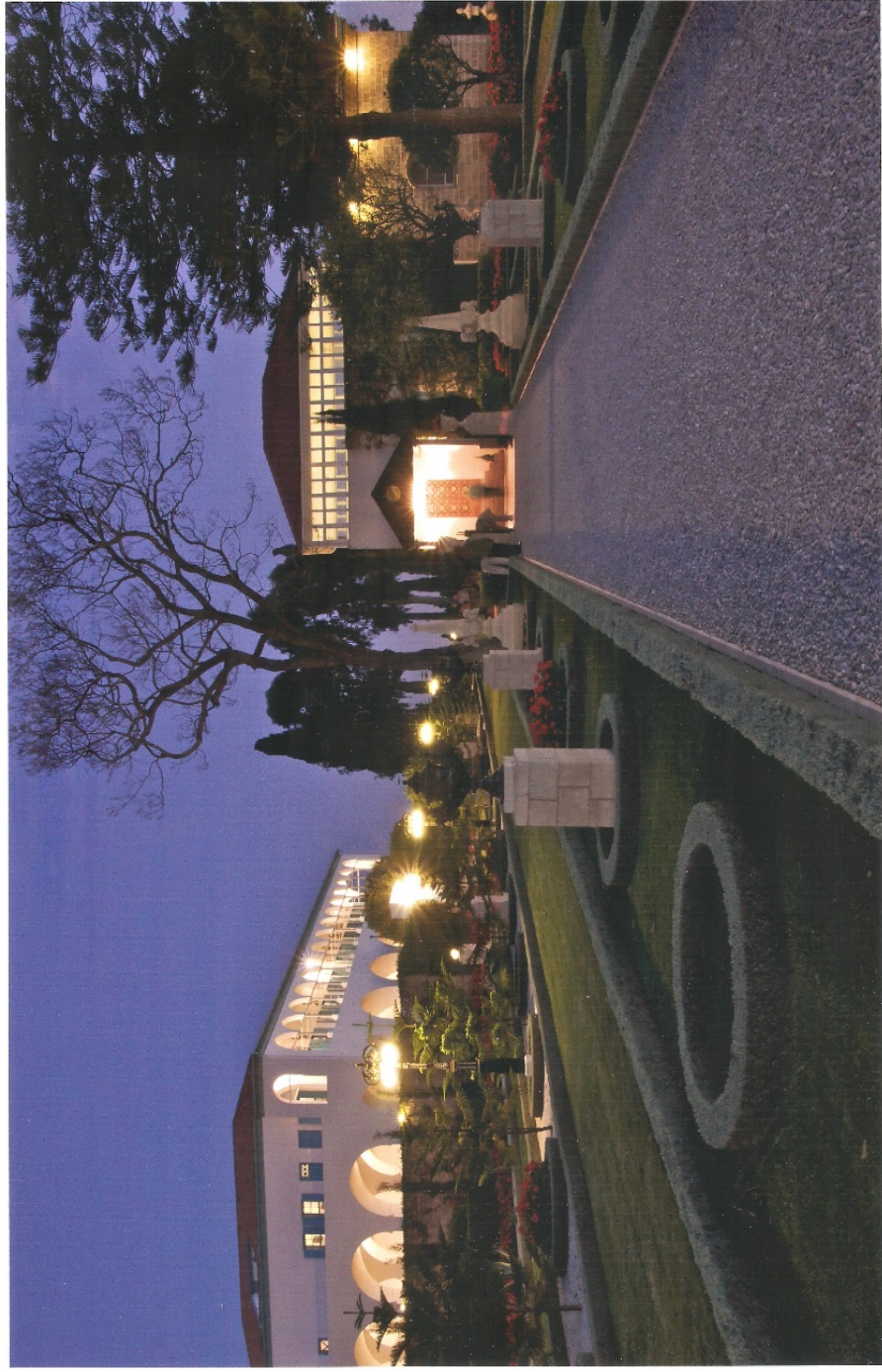
The Qiblih of the Bahá'ís in Akka. The mansion above left is where Bahá'u'lláh spent the last years of His life.